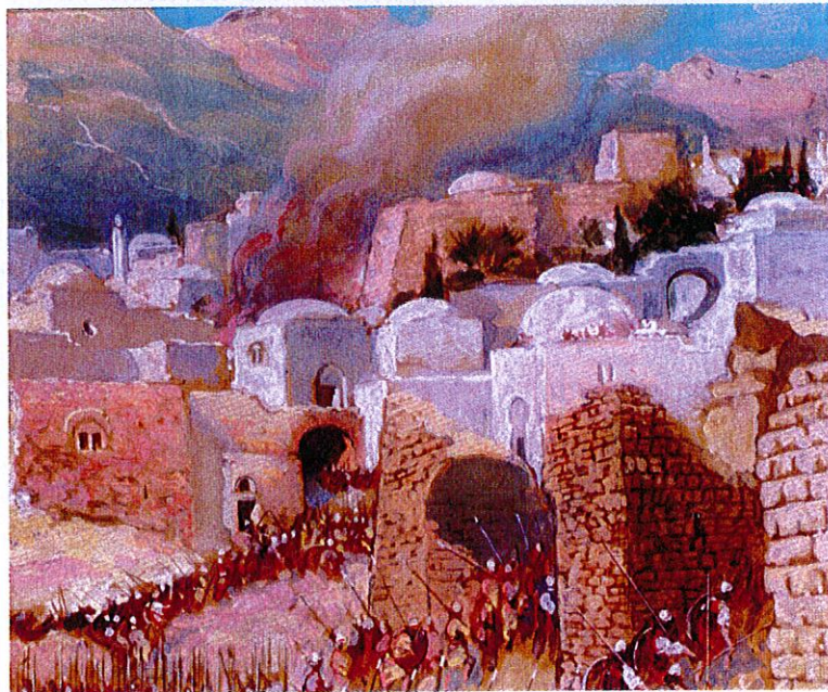
The wall built to protect the town of Jericho was destroyed and the town was captured.

The land around Jericho was very fertile. The people grew many crops and became rich. The town grew. Jericho now had to protect itself. The people built a stone wall around their town.